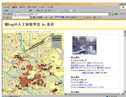
Figure 2 blog-map

In order to use location data in a weblog site, we developed a weblog tool plug-in. It enables the weblog site to extract location data from JPEG files and to link Balog system with the location data. This plug-in describes location data in RSS.