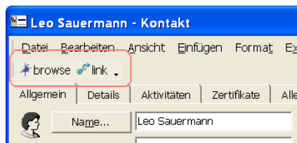
Figure 2 Gnowsis buttons in MS-Outlook

Attendees of the presentation can download the Gnowsis system from the website and install it on their own desktop systems. See below for the status of the project.